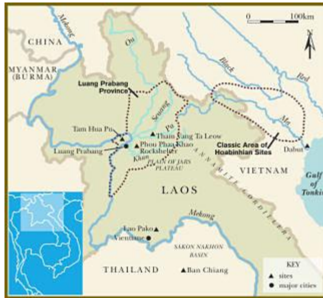
Figure 1. Map of northern Lao PDR showing major features and locations of selected sites. Click to enlarge.

The Middle Mekong Archaeological Project (MMAP) was designed to investigate the prehistoric archaeology of the Luang Prabang region, which, although centrally located in mainland Southeast Asia, has seen little previous archaeological research (Figure 1; White & Bouasisengpaseuth 2008). The Mekong has long been thought to be an ancient highway for peoples, technologies and cultures, but due to historic political conditions, vast stretches of it remained inaccessible to modern archaeology until the 1990s.