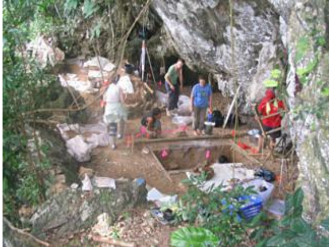
Figure 2. Excavations at Phou Phaa Khao Rockshelter. Click to enlarge.