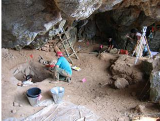
Figure 5. Excavations at Tham Vang Ta Leow. Click to enlarge.