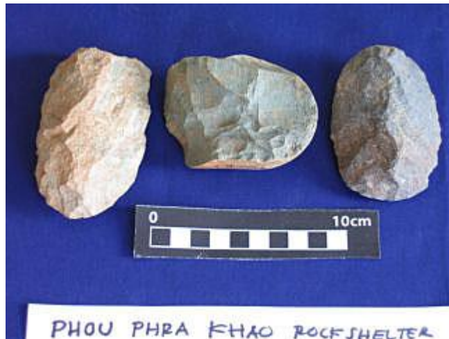
Figure 3. Typical Hoabinhian cores from Phou Phaa Khao Rockshelter. Scale = 10cm. Click to enlarge.

At PPKR, a 1x2m trench was excavated to a depth of nearly 1m. Bedrock was not reached within the excavation season. Portions of seven human burials were uncovered in the deposit; the material recovered included 2306 stone flakes, 21 cores (Figure 3) and 393 pottery sherds. Preliminary examination of flaked artefact attributes at PPKR indicates similarities to Hoabinhian technologies from north-west Thailand (Marwick 2008). Near the base of excavations, an intact burial of a juvenile (Figure 4) included an iron digging stick tip in situ under one arm. A date from a tooth from this burial indicates a late Iron Age interment (Table 1). A polished stone adze was also found near this burial but no grave cut was identified so it is not certain that the adze was a grave good. It appears that these Iron Age and possibly later burials were cut into and disturbed earlier deposits represented by the lithics.