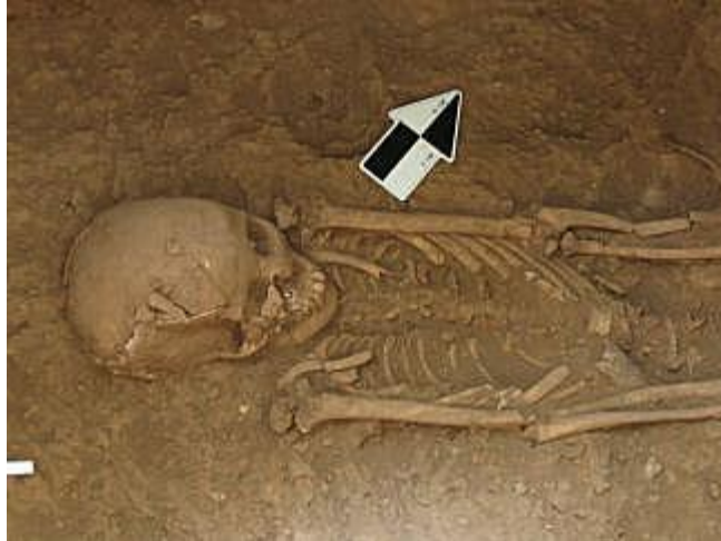
Figure 4. Iron Age Burial 5 at Phou Phaa Khao Rockshelter. Note iron digging stick tip under right forearm. Click to enlarge.