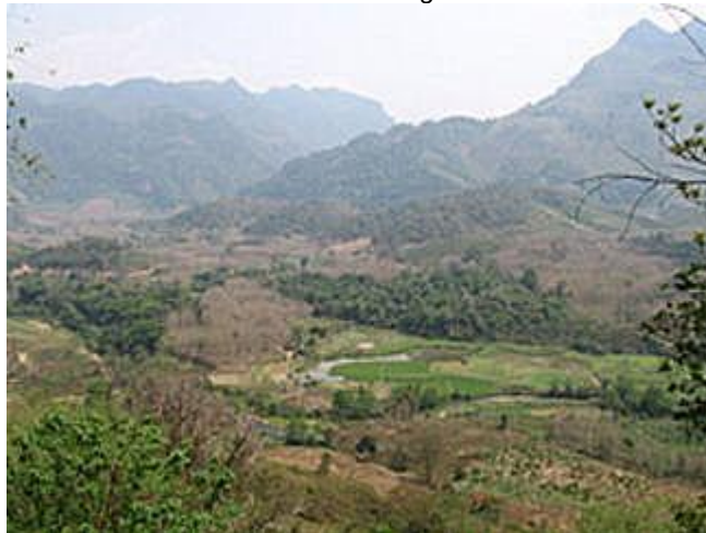
Figure 6. View downhill from Tham Vang Ta Leow, showing typical landscape, Pa River and agricultural areas. Click to enlarge.