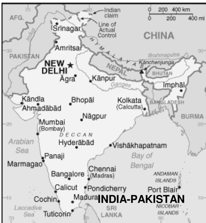
Figure 1: Four examples of partition: Ireland, Cyprus, Palestine and India